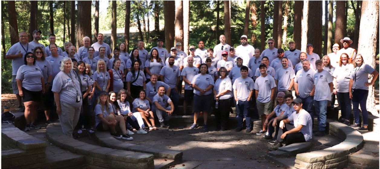
All staff photo from 2023 staff appreciation event held at Burien Community Center.

The City of Burien has six departments and approximately 97 regular full-time staff. The city has contracts for prosecution, police, fire, and animal control services.